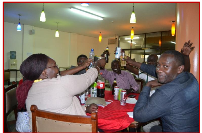
A happy team: HUC non-teaching staff celebrating end year Achievements