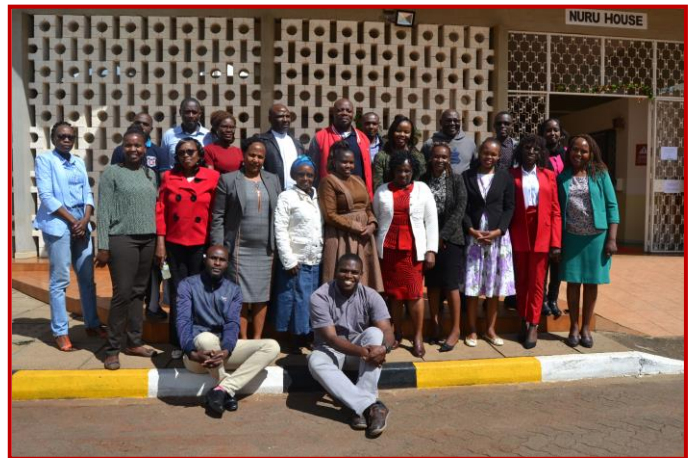
A gathering of Librarians and Archivists at Tangaza College

Yale Divinity School. The objective was to convene a roundtable discussion amongst librarians and archivists to address problems relating to both physical and digital libraries and archives. The topics of debate included data management, guidelines for the development of libraries and archives, funding for libraries, and the technology needed for archiving. Participants talked about benchmarking and best practices for African content in libraries. Due to popular demand, Tangaza University College and JHIA arranged a second gathering on November 24, 2023, as a culmination of first one. A sizable number of Christian institutions were represented during the meeting, and they came together as a “ A Knowledge Sharing Forum for Christian Libraries and Archives. ”