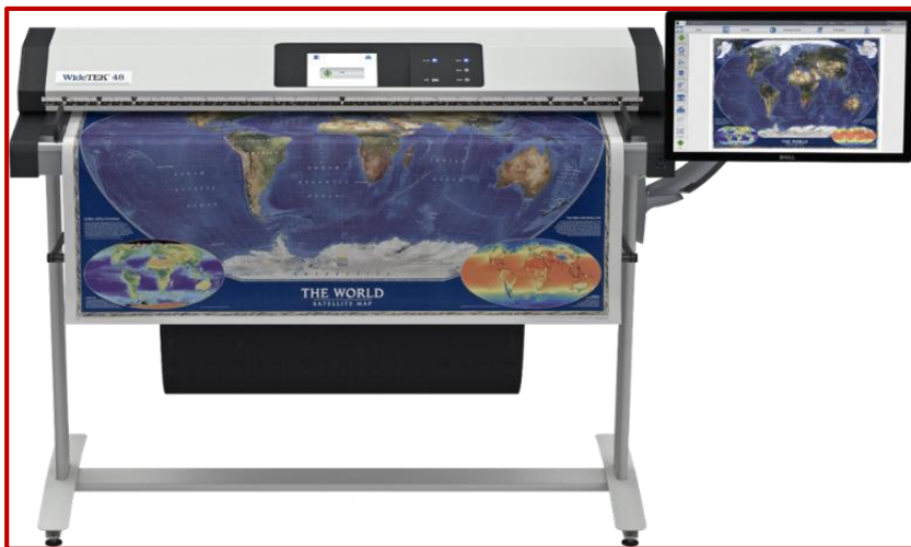
ScanWide | Big Scanners for Archiving Drawings, Maps, Books and Art. Estimated Price$20,000

well-wishers to give donations towards this critical initiative of acquiring a large format scanner with an estimated cost at $20,000. So far, we have been able to raise $1,000 from a single donor.