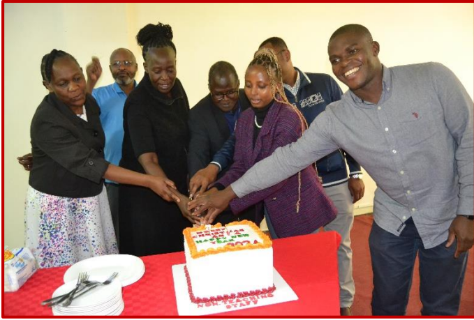
Deputy Principal Academics flagged by the Minister and Chief Librarian lead HUC non-teaching staff in cake cutting to mark their end year Achievements

are praising another colleague. For shortcomings, talk to wisely to them if you can; and hold back judgement until you really know why they act or appear the way they do. Each one of us is always running an invisible battle in some corner of their existence, just as our heavenly Father has been merciful to us!